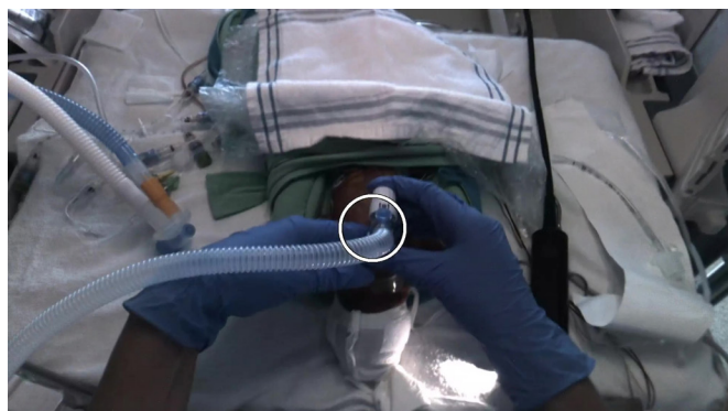
Figure 1 Snapshot of an eye-tracking video showing a healthcare provider performing positive pressure ventilation. The white circle indicates the visual focus of the provider.

(n=5) and umbilical line insertion (n=5). With these recordings, we conducted nine video-based observations (three on-site only and six on-site and online simultaneously) with a total of 88 observers filling in the questionnaire after the video-based observation. We included a short video clip with parts of recordings of a neonatal intubation, an umbilical line insertion and a MIST procedure as online supplemental material.