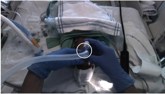
Figure 1 Snapshot of an eye-tracking video showing a healthcare provider performing positive pressure ventilation. The white circle indicates the visual focus of the provider.

(n=5) and umbilical line insertion (n=5). With these recordings, we conducted nine video-based observations (three on-site only and six on-site and online simultaneously) with a total of 88 observers filling in the questionnaire after the video-based observation. We included a short video clip with parts of recordings of a neonatal intubation, an umbilical line insertion and a MIST procedure as online supplemental material.