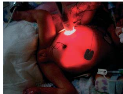
Figure 1 Transillumination of the abdomen showing pneumoperitoneum.

We highlight these two points relating to a recent case. A 29 week gestation baby girl was born by vaginal delivery. She initially required conventional ventilation for her lung