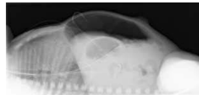
Figure 2 Abdominal radiograph confirming pneumoperitoneum.

disease. An umbilical arterial catheter was inserted but removed after a few hours due to duskiness of the toes. On day 2 she was extubated and nCPAP was tried. After a few hours, her condition deteriorated and she returned to conventional ventilation. On day 4, she was started on enteral feeding, using small volumes of breast milk, but had mild abdominal distension and some aspirates. Feeding was stopped. Her abdomen deteriorated and she had persistent metabolic acidosis. Transillumination of her abdomen was positive (fig 1) for pneumoperitoneum and was confirmed by abdominal x ray examination (fig 2). At laparotomy, two small gastric perforations were identified with local areas of infarction. These were oversewn, with excellent results.