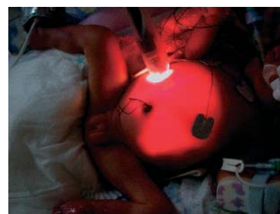
Figure 1 Transillumination of the abdomen showing pneumoperitoneum.

We highlight these two points relating to a recent case. A 29 week gestation baby girl was born by vaginal delivery. She initially required conventional ventilation for her lung