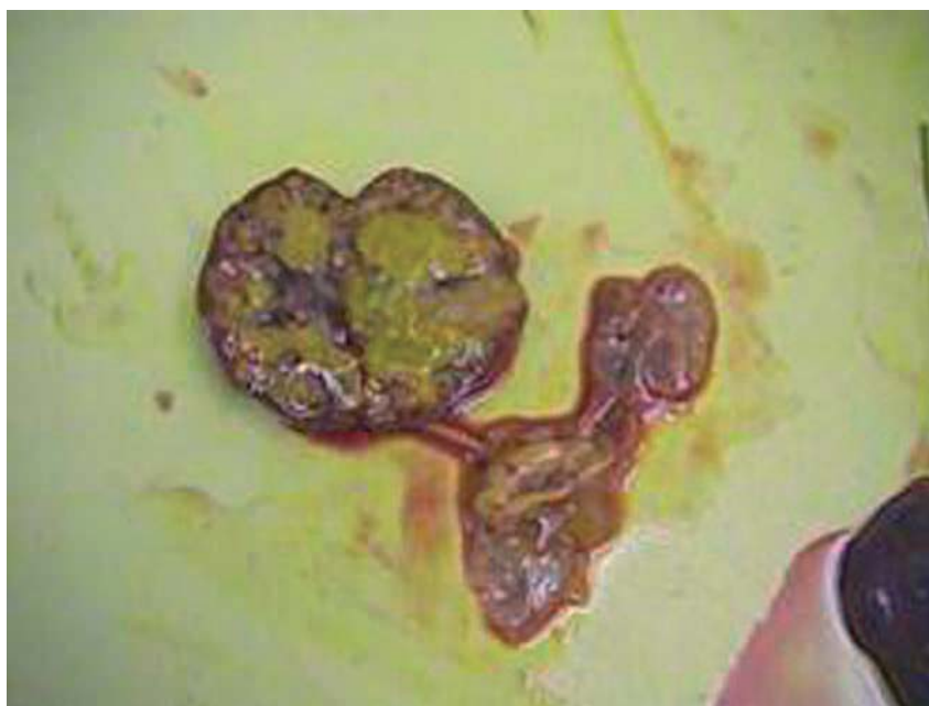
Figure 2 Gross pathology, showing multiple fungal abscesses.