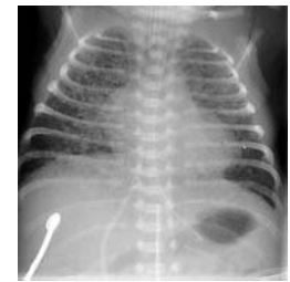
See p 161