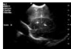
See p 410