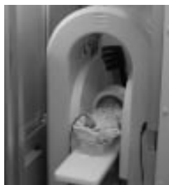
See p 203