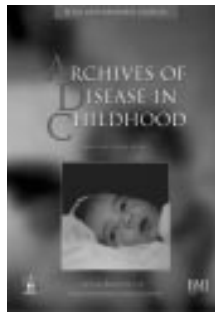
Healthy abandoned baby, the fourth female child in her family, India

www.publicationethics.org.uk This journal is a member of and subscribes to the principles of the Committee on Publication Ethics