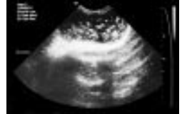
See p 74