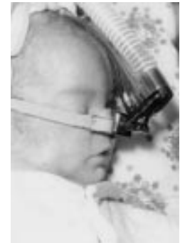
See p 204

210 Examination of the neonatal palate H Armstrong, R M Simpson