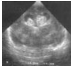
See p 72

Coloured MRI scan of a fetus in its mother's uterus during the 36th week of pregnancy.