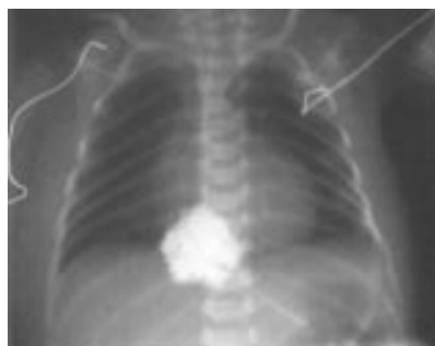
Figure 2 Radiograph showing spillage of dye in the extraperitoneal space.

In each of these case reports, femoral catheter tip migration was detected after extravascular extravasation of blood or parenteral nutrition fluid. Haemoperitoneum has been reported in the past as a complication