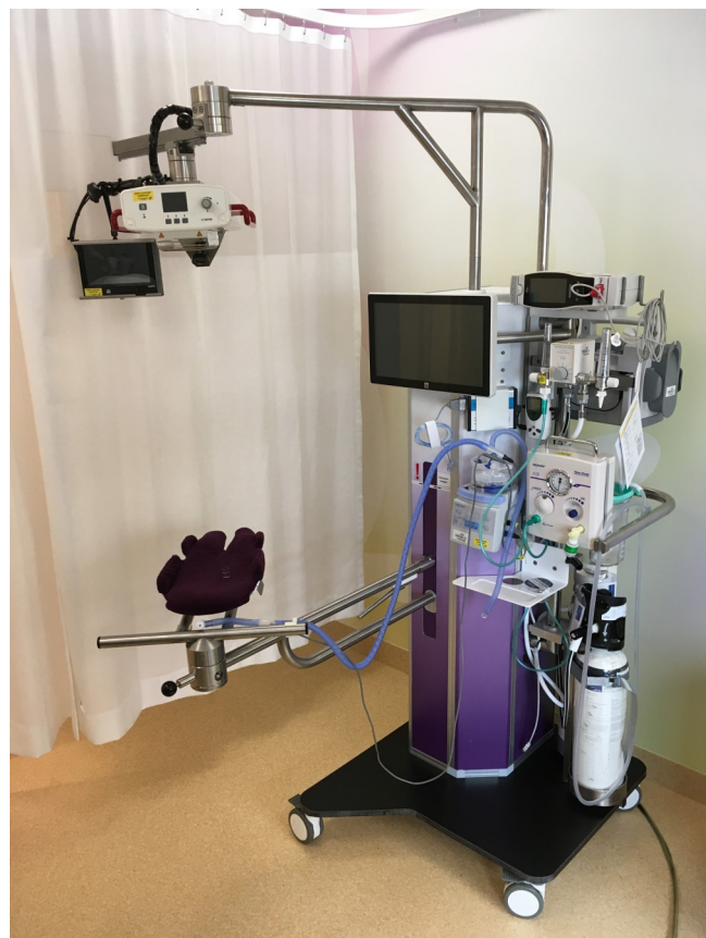
Figure 1 Specially designed new resuscitation table, including the platform for the infant, which can be turned above the mother's pelvis. The table is fully equipped to provide complete standard care and has a respiratory function monitor built in.

numerous practical issues, as well as potential pitfalls, need to be addressed before implementation of PBCC is possible.