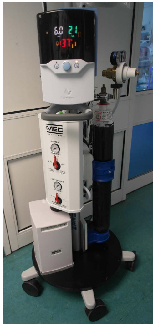
Figure 1 Mobile nasal high flow.

We followed a standardised clinical protocol for stabilisation ( figure 2 ). The mobile apparatus could normally be set up and started within 2 min, requiring a further 2–3 min to reach the desired temperature of 37°C. During this time routine checks on the resuscitation equipment were carried out. Babies were placed into a plastic bag on a resuscitaire under a radiant warmer and assessed for the presence of breathing, heart rate and activity. Nasal prongs ('premature' size, Vapotherm) were applied and a flow of 6–7 L/min was commenced (not a step-wise increase, but clinician preference for initial flows varied). Flows up to 8 L/min were permitted by our standard guidelines. Preductal pulse and oxygen saturation monitoring was also