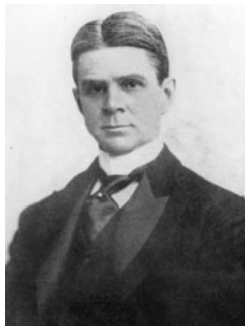
Figure 1 Luther Emmett Holt (1855–1924).

During his career, Holt published three books and 170 papers on a wide variety of subjects. His first book on the care and feeding of