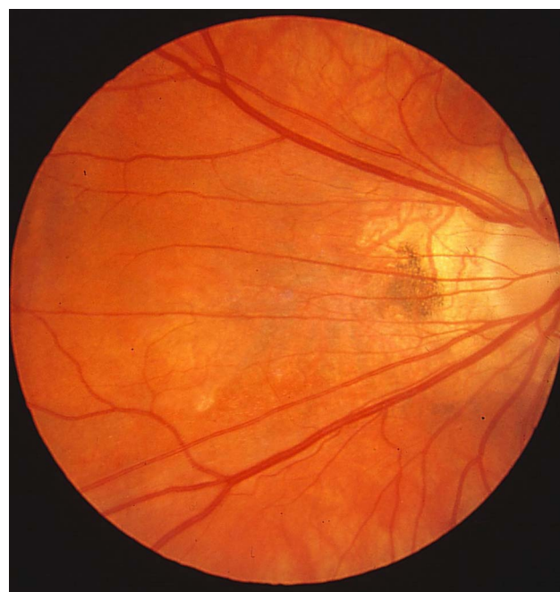
Figure 1 Straightening of the retinal vessels arising from the optic disc and narrowing of the angle between the major vessels. Mild dragging of the vessels to the left of the image, extending across the macula towards the temporal retinal periphery.

Early exteriorisation due to preterm birth shortens the intra-uterine period and removes the fetus from a protective environment ideally suited to promote growth and provides the optimal level of stimulation. Unsurprisingly, the visual system of the preterm baby can be affected by removal from this milieu as well as by exposure to a very different biological and physical environment. Fledelius demonstrated over 30 years ago that the eyes of children born prematurely but who did not have ROP did not grow normally. 18 He showed that structures at the front of the eye, namely the cornea and lens, both of which play a vital role in focusing light onto the retina, were different: